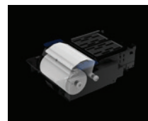
Integrated head wiper with user replaceable fabric roll.