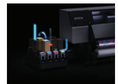
Ink Supply System holds up to 80 L with automatic hot-swap