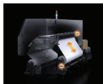
Heavy roll support with active intelligent feed management