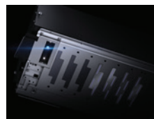
Advanced media set-up with automatic self adjustment