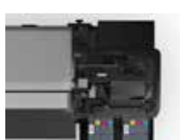
Efficient production with single operator media loading.