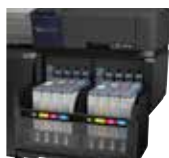
High capacity 15 / 18L CISS. Tanks can be refilled while printing continues