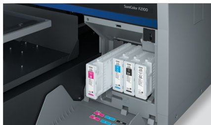
Low maintenance design with improved self-cleaning print head and new auto cap washing system